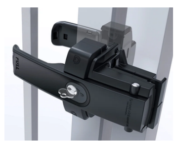
Lokklatch Magnetic Operates and locks from both sides without need for additional padlocks. Rekey by locksmith to match other keys.

When it comes to manual gate hardware, Designer Gates only uses the best! Find below our most popular hardware items and brands. Talk the team about the hardware that will achieve the visual appeal and security you desire.