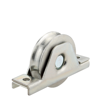
Rebate U Groove Wheel Sliding gate wheel rebated inside the frame to provide a mechanical wear to paint. Can minimal gap underneath the gate and a sleek design.