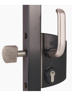
Sliding Gate Lock Manual sliding gate latch with unique Twistfinger design guarantees a perfect close and is key lockable.